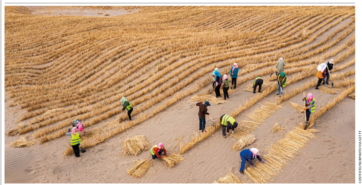
Workers plant straw barriers in desert areas in northwest China's Gansu province to stop sand from spreading, aiding afforestation.