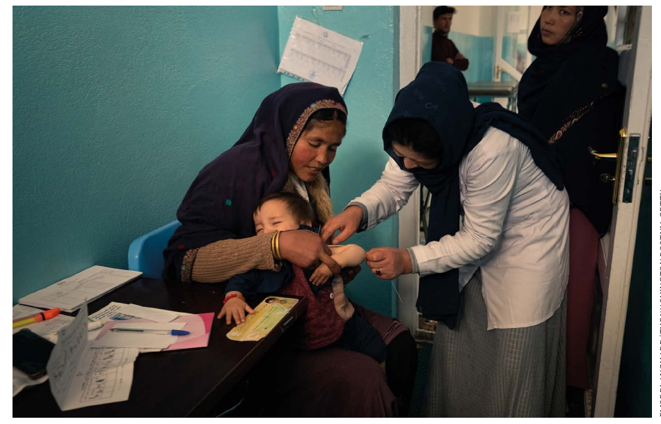
A nurse examines a child in Afghanistan for malnutrition.

Regarding capabilities, UN member states should adopt a balanced and multilateral knowledge-based approach to the SDGs framework. Publicly funded research systems should be deployed, nationally and globally,