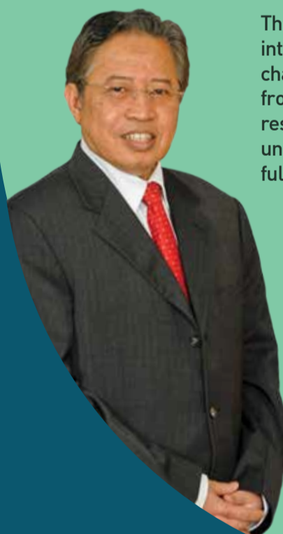
THE RIGHT HONOURABLE DATUK PATINGGI TAN SRI (DR) ABANG HAJI ABDUL RAHMAN ZOHARI BIN TUN DATUK ABANG HAJI OPENG Premier of Sarawak

Through APGH 2024, we will delve into the intricate tapestry of opportunities and challenges that lie before us. We will hear from industry titans, cutting-edge researchers, and visionary policymakers, all united by a common purpose: to unlock the full potential of green hydrogen and pave the way for a cleaner, greener future.