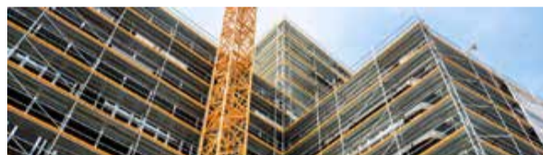
PERI UP Flex Modular Scaffolding System Safe, flexible and efficient solutions for industrial applications

High level of working safety With the continuous guardrails and toeboards on all sides and non-slip working design. High flexibility with enormous adaptability The integrated system and arrangement of 20 mm allows change of almost any adjustments to be made to suit local site conditions, without any tube couplers. Fast assembly and growing efficiency Gravity Lanes, self-leveling deck and pre-weight components facilitate safe, fast, safe and cost-effective installation.