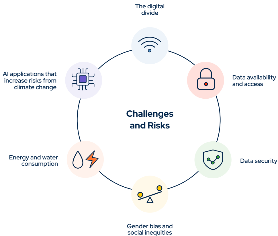
Challenges and risks associated with AI